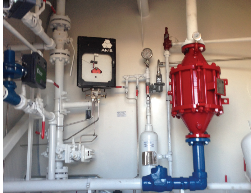
Inside the walk-in separator building